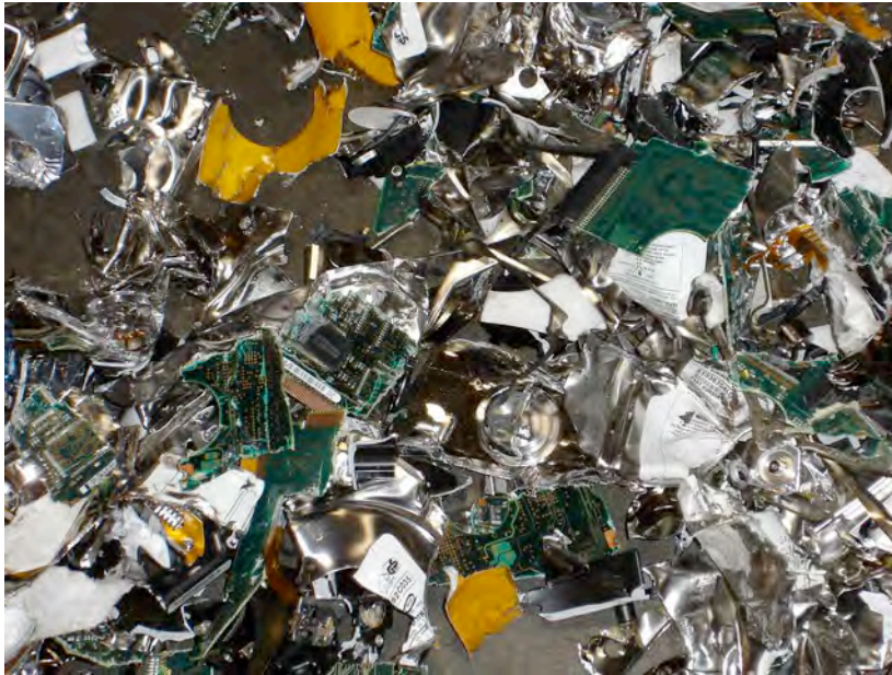
Picture 4: This is circuit board without aluminum or any other metals. It is then sent through another sorter to sort plastics out.